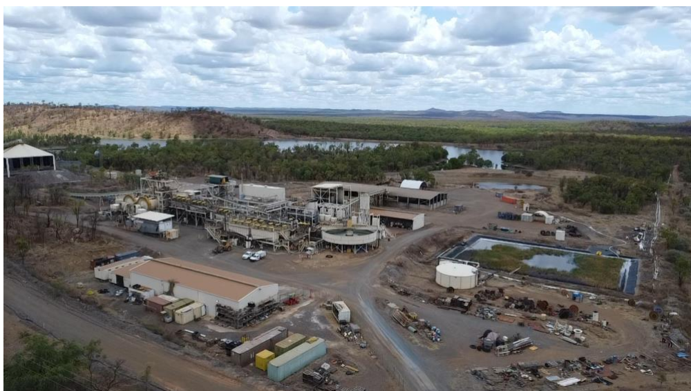
Figure 2. Mungana Processing Plant.