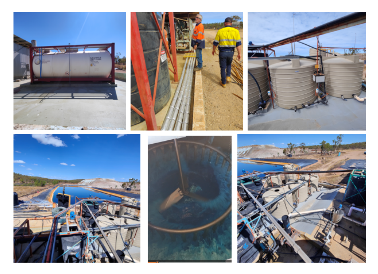
Figure 1. Tartana Solvent Extraction – Crystallisation Plant. Clockwise – New acid tanks with delivered acid, Inspection of pipework, New tanks for copper stripping, View of plant tanks and pipework, Copper sulphate crystals in crystalliser, Plant, PLS pond and heaps for leaching in distance.

The plant has produced some of the highest quality Copper Sulphate Pentahydrate in the world with several proprietary plant components enabling the extraction of impurities and a producing a higher quality final product.