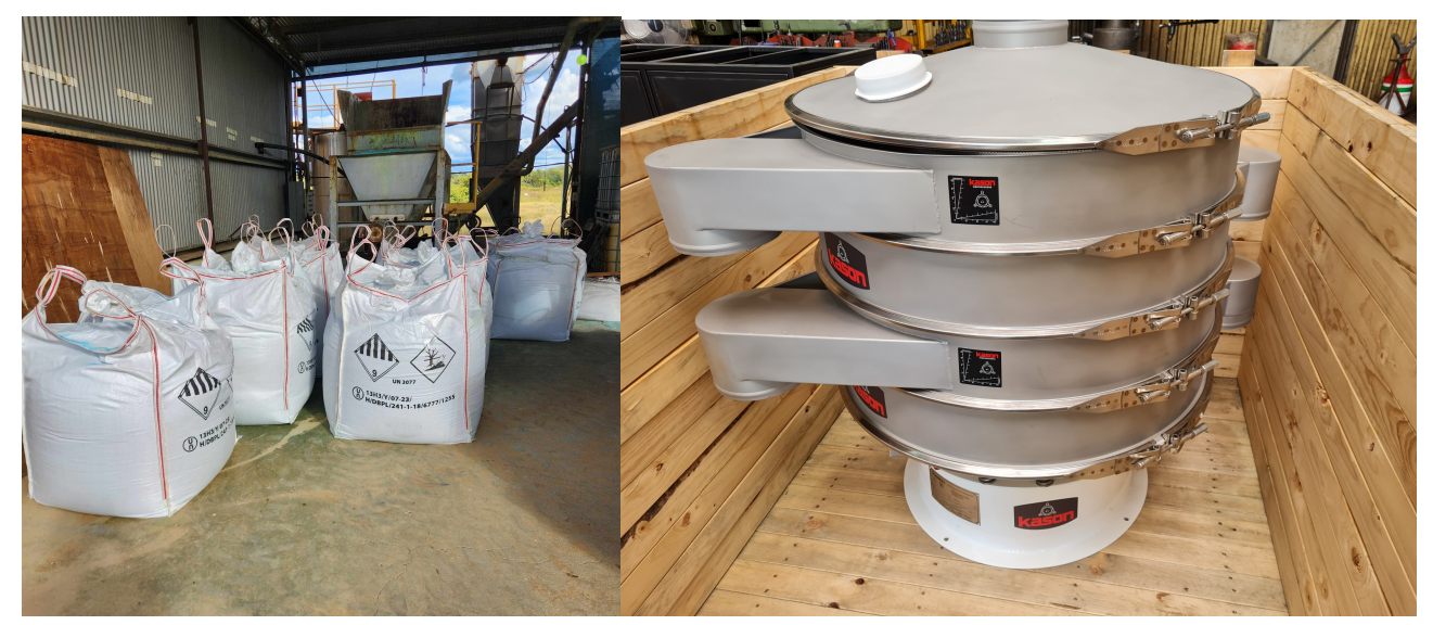
Figure 1. (Left) Production toward the second shipment. (Right) The new Kason Kason Vibroscreen Separator.

Plant reliability is improving, and the Company is recovering from both the challenges of the wet season and the deterioration of equipment such as the screen. The Company has purchased a new 3 Deck Kason Vibroscreen Separator from DTD Engineering, which will improve the product, enabling the sale of Tartana copper sulphate to premium markets with stricter product requirements. The bag scales are also being repaired to ensure constant bag weights.